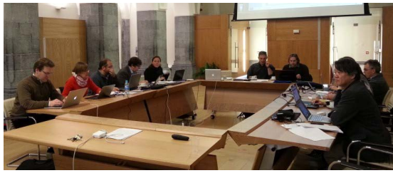
Photo: Future SOLAS Workshop