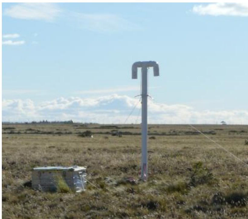
Figure 2: Atmospheric sampling station set up at Rio Gallegos.

a limited cost the spatial (2D) distribution of the atmospheric concentration of trace metals in Patagonia, we collect and analyses lichens harvest in a large area around. Lichens are slow-growing organisms which, over their lifespan, are expected to accumulate and retain high levels of mineral elements present in the atmosphere, but not from the host tree limb or rocks from which they are suspended. It can not be used for temporal studies but it has been shown through large and systematic investigations that the variations in lichens chemical composition are reflecting the variations of local aerosol chemical composition integrated on large time periods (Monna et al., 2006, Monna et al., 2011). In an emission area, lichen chemical composition will reflect the average composition of the emitted aerosol.