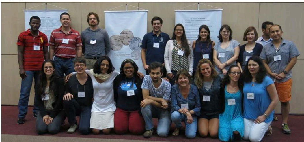
Figure 3 - Participants of the Joint BrOA – SOLAS Workshop in Santos, Brazil (March 2015).

* India / Brazil / South Africa (IBSA) Workshop on Earth System Modelling , São Paulo, June 2015, Organised by P. Nobre (INPE).