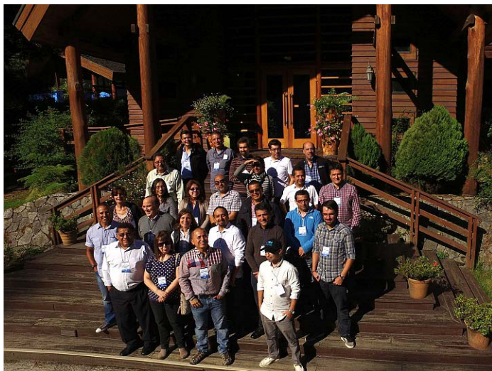
Figure 2 – Participants of the LAOCA Workshop, held in December 2015 in Concepción, Chile.